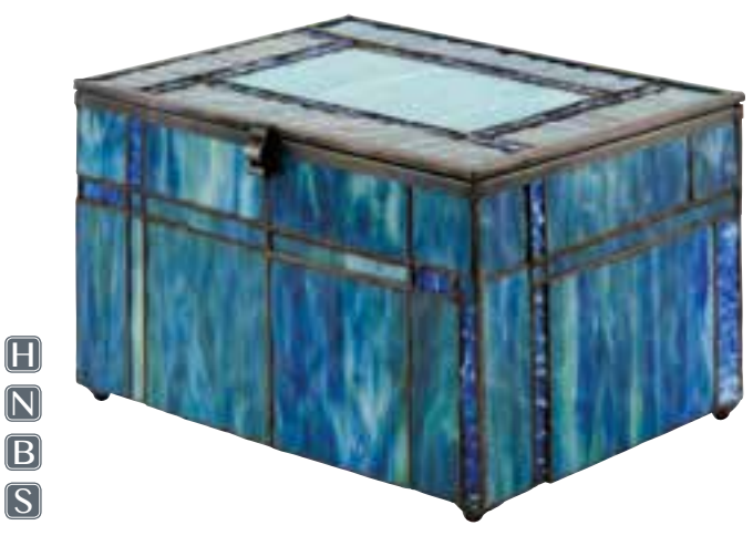
Seaside Handmade stained glass memory chest