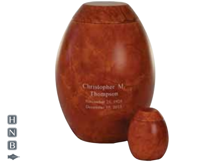
Madrid & Madrid Keepsake Alabaster urn with optional personalization