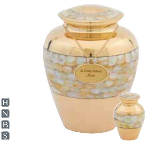
Mother of Pearl & Mother of Pearl Keepsake Brass urn with natural mother of pearl. Charm not included.