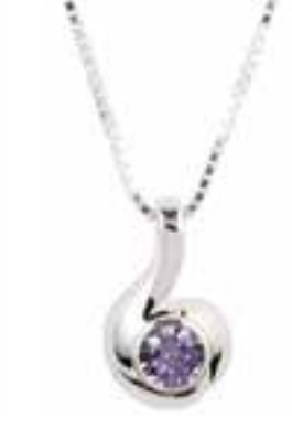
Swirl w/ Birthstone Shown w/ February Price: $175