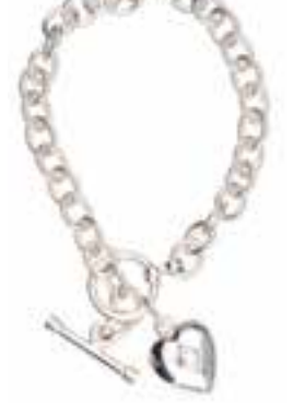
Toggle Closure Charm Bracelet with Heart w/ Clear CZ Stone Price: $255