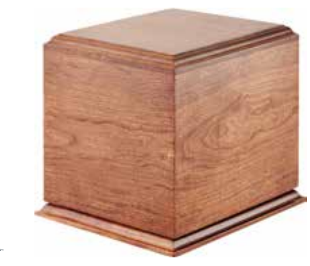
Avon Cherry Cherry hardwood urn with natural finish