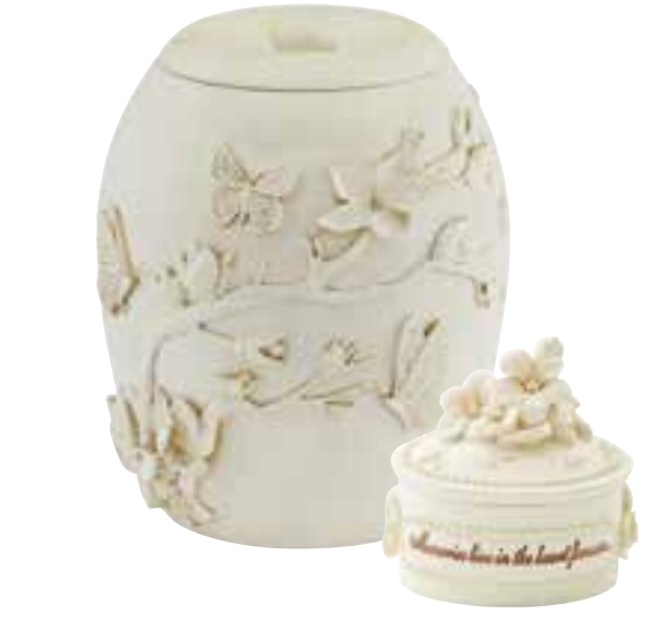
Blossoms and Butterflies & Blossom Keepsake Composite statuary urn with 3D detail