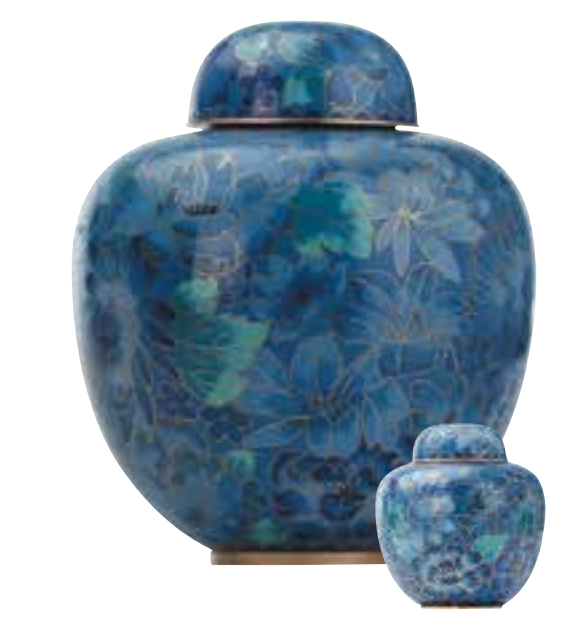
Blue Sapphire & Blue Sapphire Keepsake Traditional Cloisonné design with intricate pattern